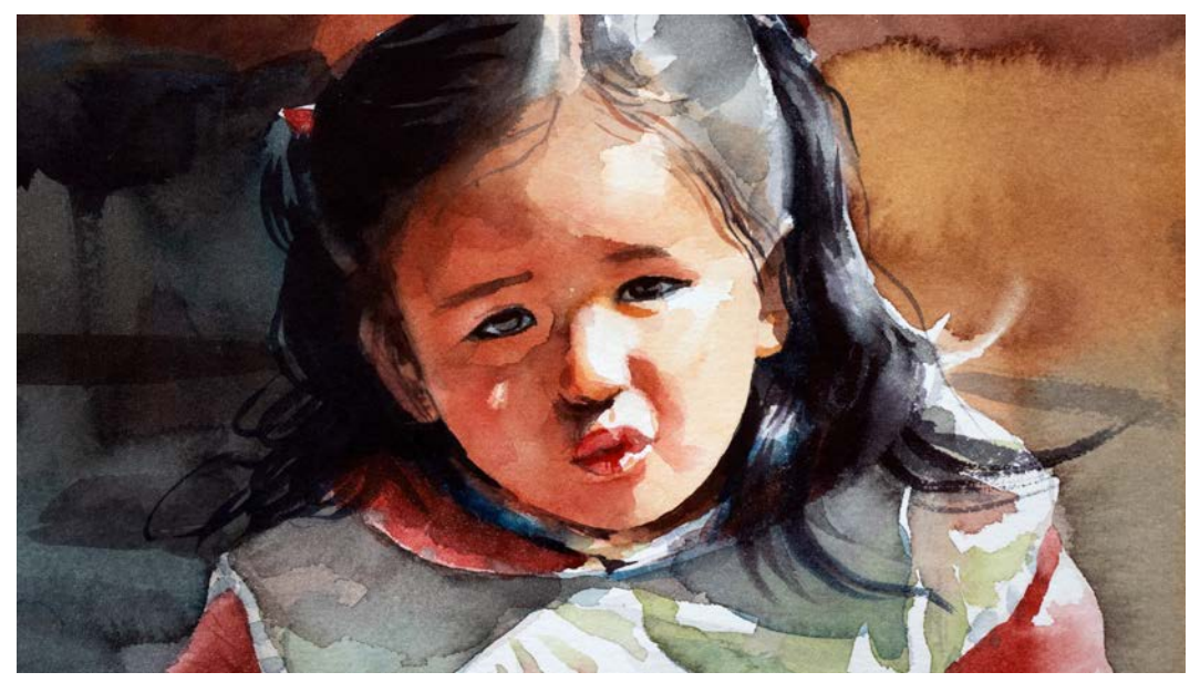
Use this link to visit the lesson on Gumroad.