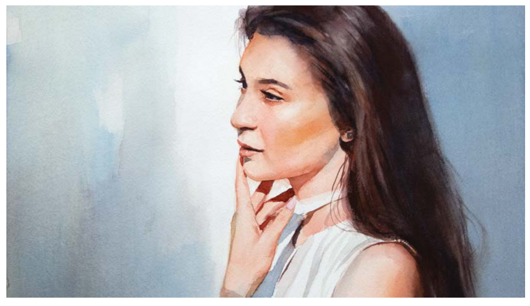
Use this link to visit the lesson on Gumroad.

(Members can view all full lessons in the Member Learning Center)